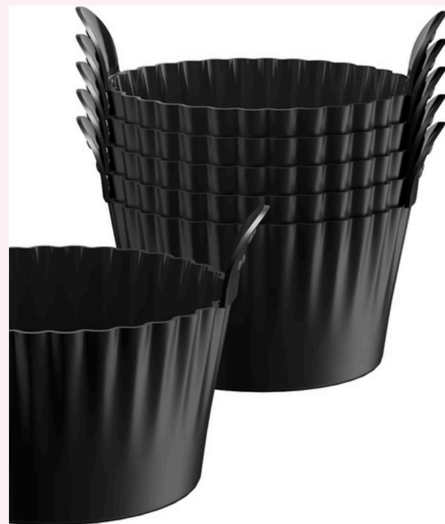
Silicone muffin cases perfect for muffins, eggs, mini frittatas and bakes.