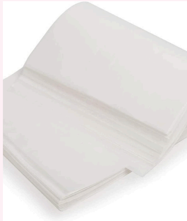
Pre-cut baking paper sheets line the basket in seconds, no mess, no sticking & less washing up.