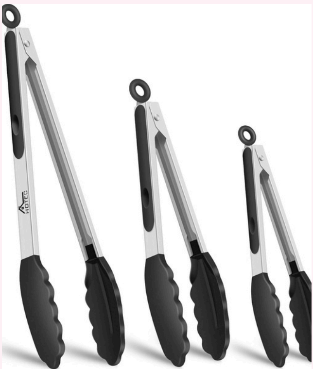
Silicone tongs gentle on your basket coating, essential for flipping and serving.