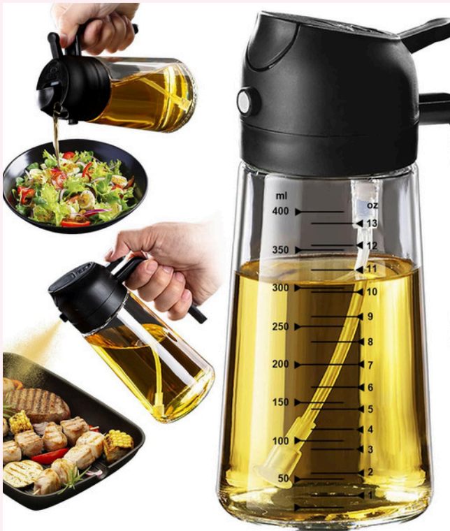
Oil mister for an even, lighter coating of oil.